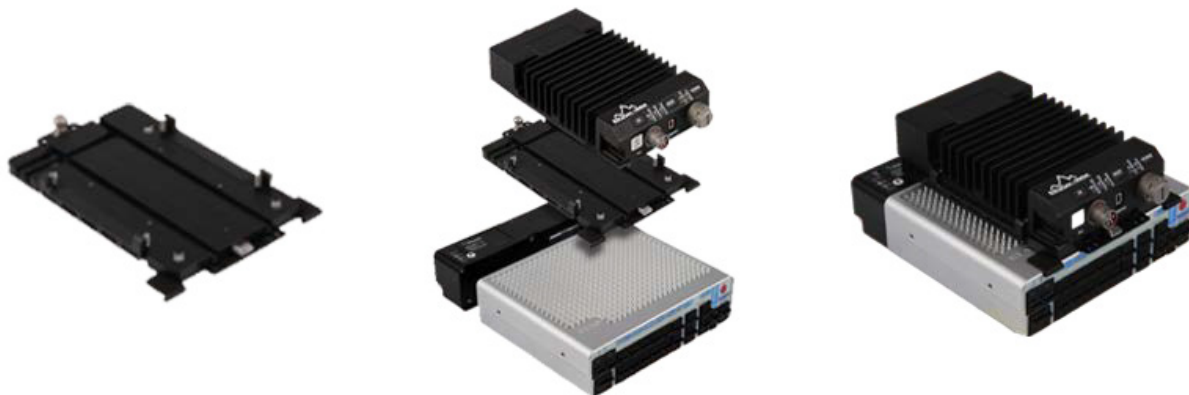
Figure 1: ViaSat KG-250X Bracket