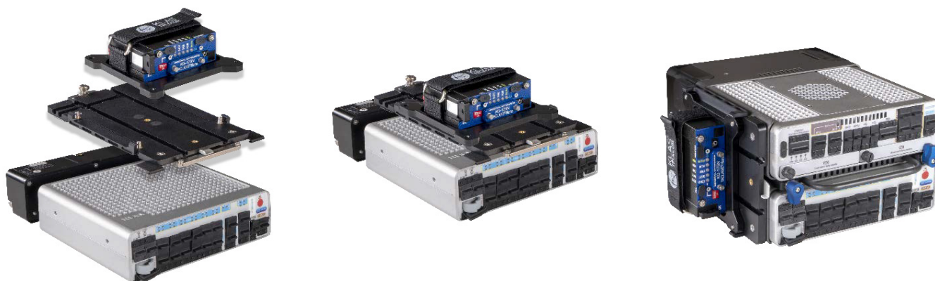
Figure 3: TACLANE-Nano KG-175N Bracket